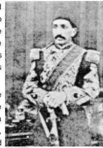
Khalifah Sultan Abdul Hameed II