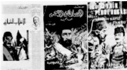
A conspiracy to distort the immense work carried out by Khilafah Sultan Abdul Hameed the Second.